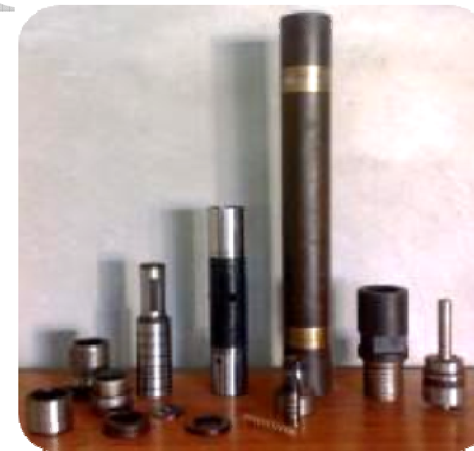
PARTS OF KGR DTH HAMMER

Equivalent Shank Type: PANTHER, DHD-340, COP-42.