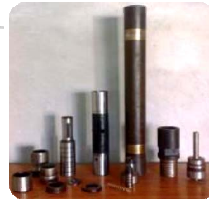
PARTS OF KGR DTH HAMMER

NOTE: As per the customer's specifications we manufacture all type of DTH Hammers & Button Bits.