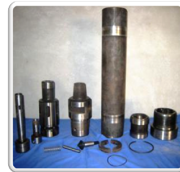
PARTS OF KGR DTH HAMMER

Equivalent Shank Type: SD-4, QL-40, DHD-340, COP 42.